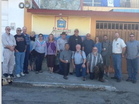
December 2012 Trip to Santiago, Guatemala