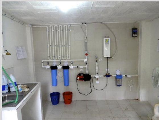
Completed clean water system using filters and ozone to remove harmful bacteria.