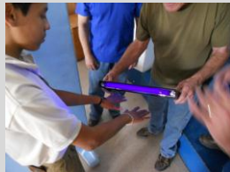
Checking for germs under a black light in Guatemala