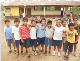
Rural school outside of Chiquimulilla, Guatemala, February, 2013